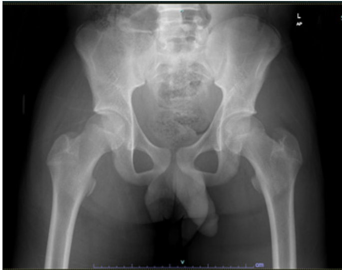
Figure 1: Pelvis X-ray of the patient.

“there is evidence of right hip effusion evident as increased turbid/echogenic fluid in the anterior synovial recess on the right hip when compared to contralateral left hip. In addition, mild hypervascularity of the synovium which could represent synovitis in appropriate clinical sittings” (Figure 2).